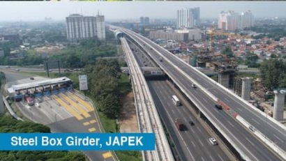
Steel Box Girder, JAPEK