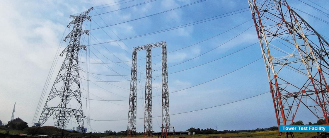
Tower Test Facility