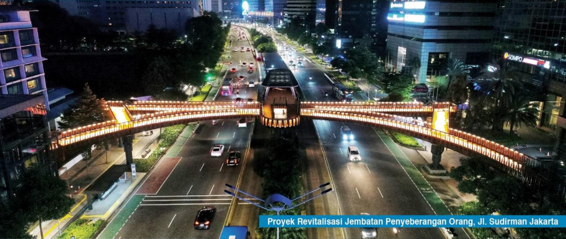
Proyek Revitalisasi Jembatan Penyeberangan Orang, Jl. Sudirman Jakarta