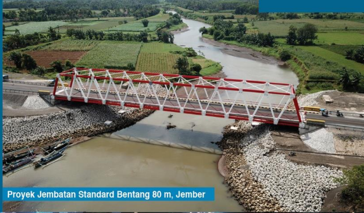
Proyek Jembatan Standard Bentang 80 m, Jember