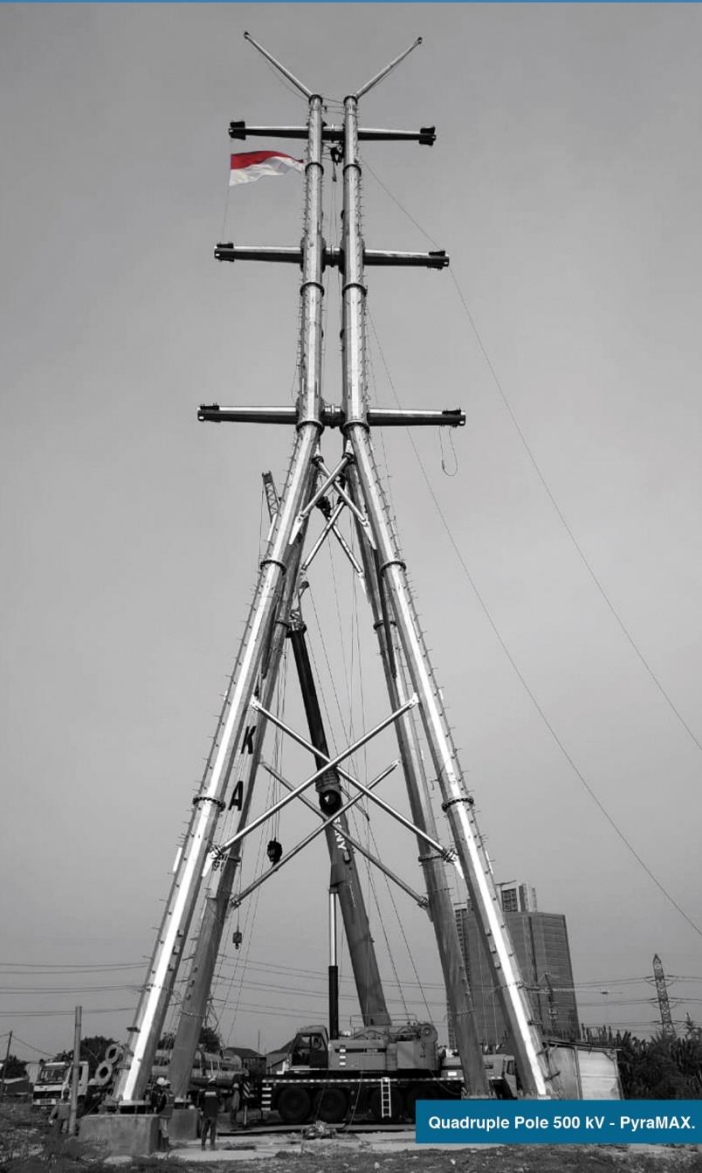
Quadruple Pole 500 kV - PyraMAX.