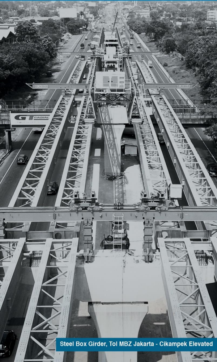
Steel Box Girder, Tol MBZ Jakarta - Cikampek Elevated