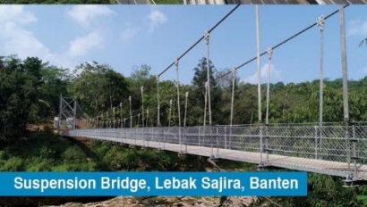
Suspension Bridge, Lebak Sajira, Banten